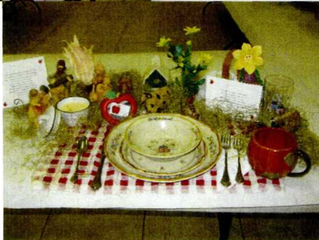
Bring your own place setting